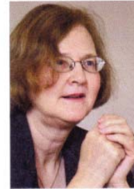
Jack W. Szostak